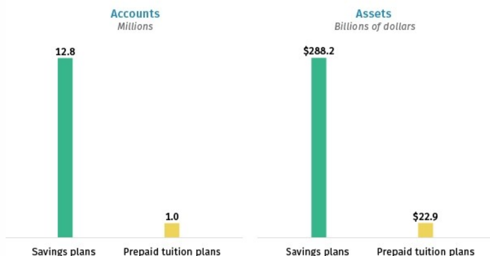
Figure 1 529 Savings Plans Are Popular Year-end 2018

At year-end 2018, assets in both types of 529 plans totaled $311.1 billion , representing 13.8 million accounts. 529 savings plans have grown in popularity, holding $288.2 billion in assets at year-end 2018 on behalf of 12.8 million accounts (Figure 1).